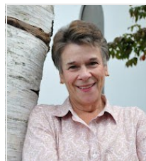
Ann Freeman Chair