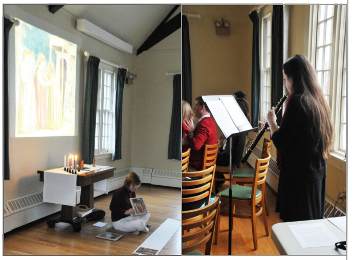
Continued on page 5