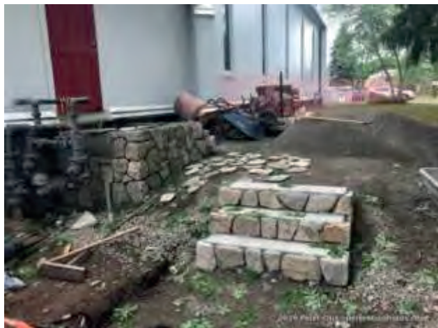
Renovation of Sacristy Steps in Progress

Many have asked “What’s going on with the stairs outside the sacristy?” The answer is simple. New stairs are being built to replace the crumbling ones that were there. The answer to the question “What’s taking so long?” is not so simple. The stairs were scheduled to be repaired in 2018; but we were slowed by the process of finding the best person to do the job, bad weather, and code restrictions. It was learned that we needed to build new stairs rather than just repair the crumbling ones; and we also learned that, according to code regulations, we needed to connect the stairs to an existing sidewalk. With the help of Tony Terry, our architect, and Marty Hallier, our Buildings and Grounds Chair, plans were designed, permits obtained, and a mason was hired. The stairs and sidewalk are now under construction, and should be ready for use in mid-June. We look forward to having this improved entrance to our church.