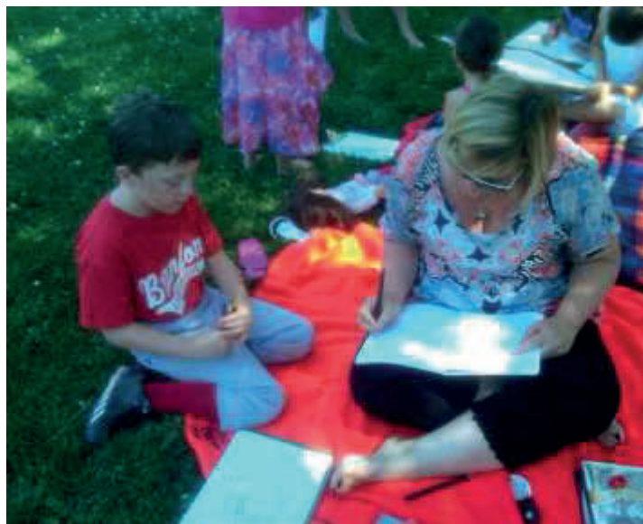
Summer Sunday School - Class on the Grass